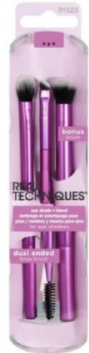
Eyeshadow Brushes -for eyeshadow -this can be found at Walmart "real techniques" brand is amazing for all brushes!