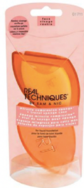
Beauty Blender -for foundation and concealer -my fav are from Walmart "real techniques"